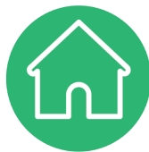
LIDAR-assisted 3D Modeling