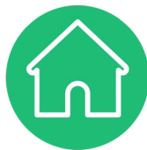
LIDAR-assisted 3D Modeling