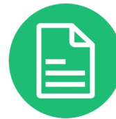
Customizable Sales Proposals