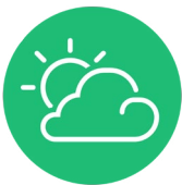
Bankable Remote Shading