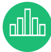
Accurate Production Estimates