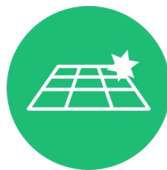
Easy PV System Design